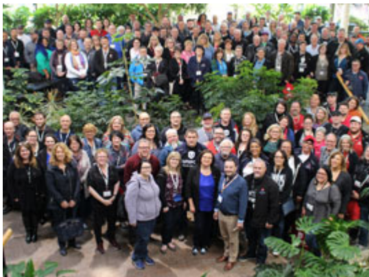
Friends and comrades gathered for Atlantic